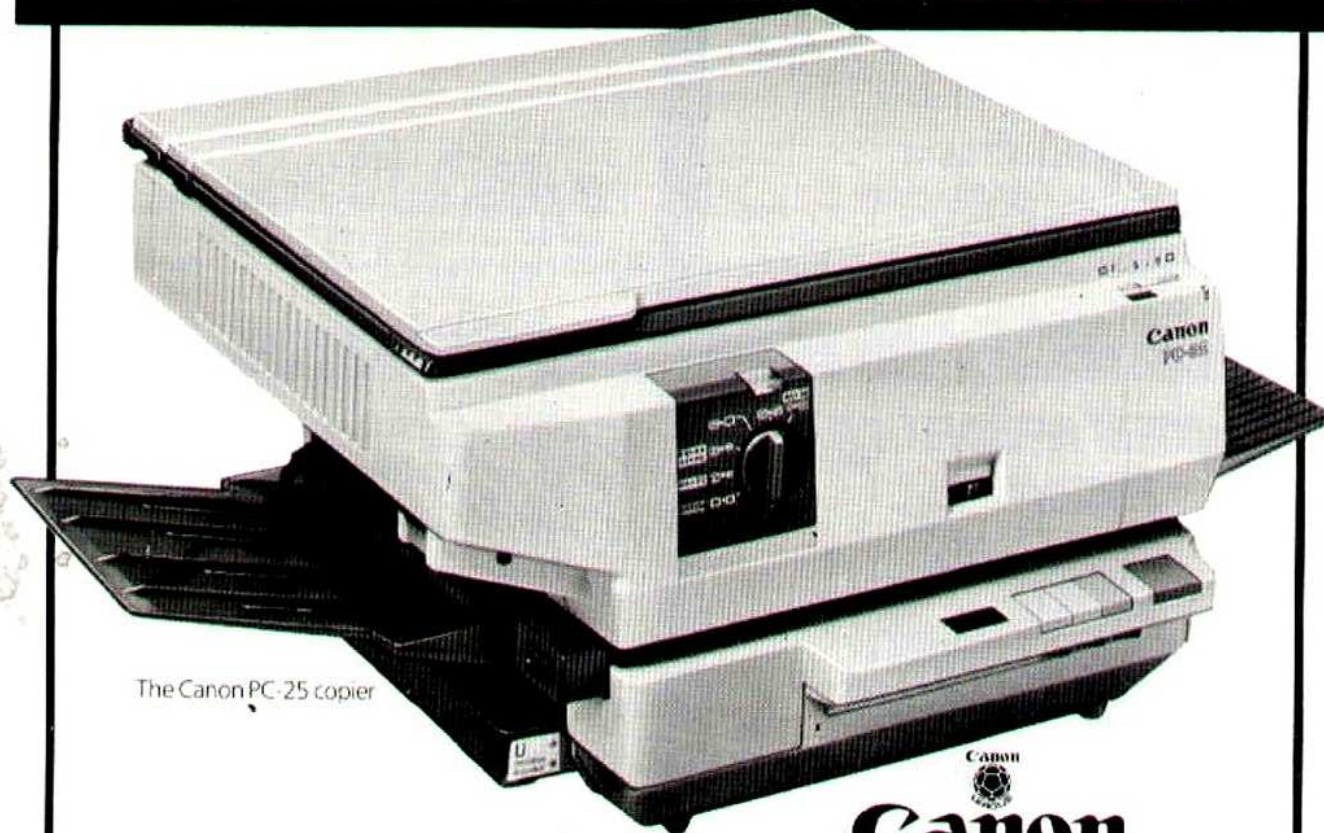
The Canon PC-25 copier

So reliable you'll never need a substitute.